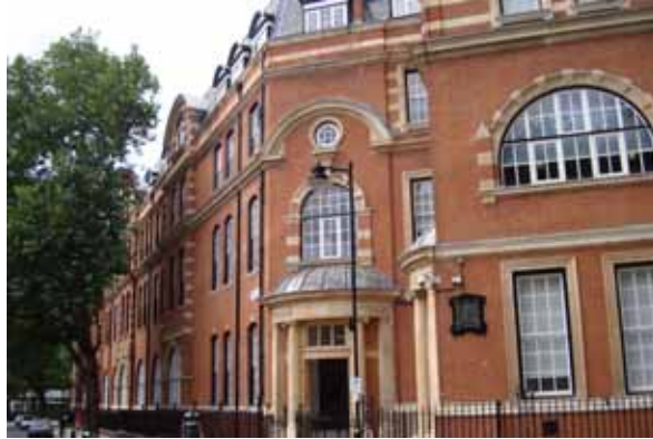
<Appearance of the building>