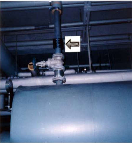
Storage tank PT- 75DS