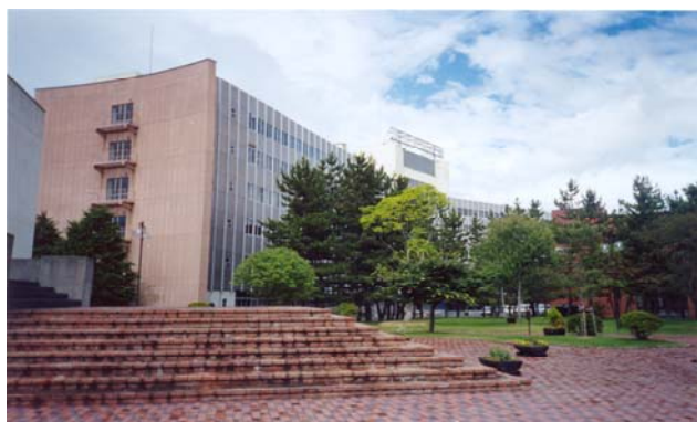
Appearance of the building