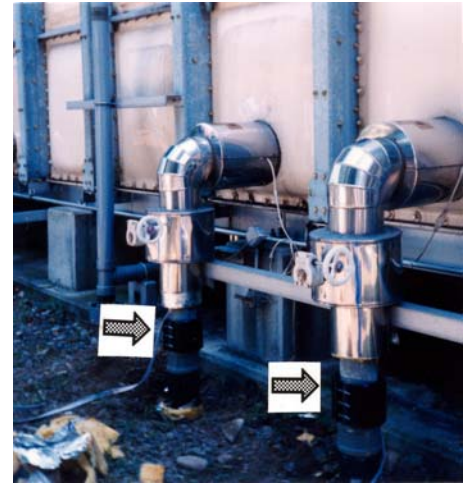
On outlet pipe of receiver tank PT- 75DS · PT-100DS