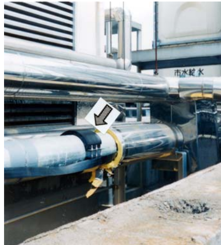
On outlet pipe of elevated tank PT-150DS